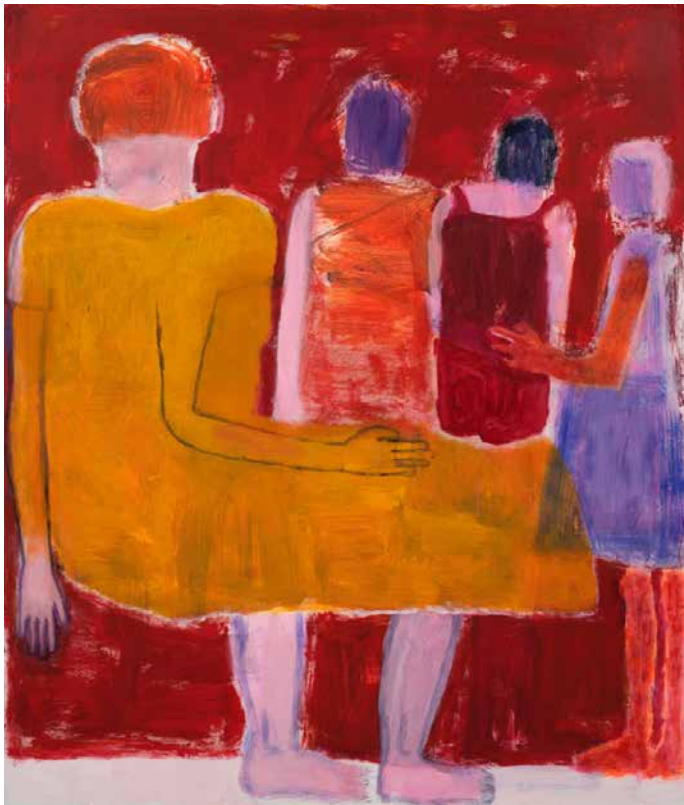
Katherine Bradford, Mother's Lap , 2020. Acrylic on canvas. 60 x 48 in. Courtesy of the artist and Canada, New York. Private collection. Photographed by Joe DeNardo.