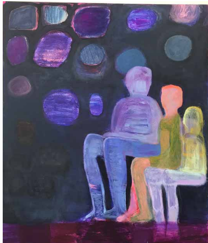
Katherine Bradford, Fear of Dark , 2020. Acrylic on canvas. 80 x 60 in. Courtesy of the artist and Canada, New York. Collection of the Bowdoin College Museum of Art, Brunswick, ME. Photographed by Joe DeNardo.