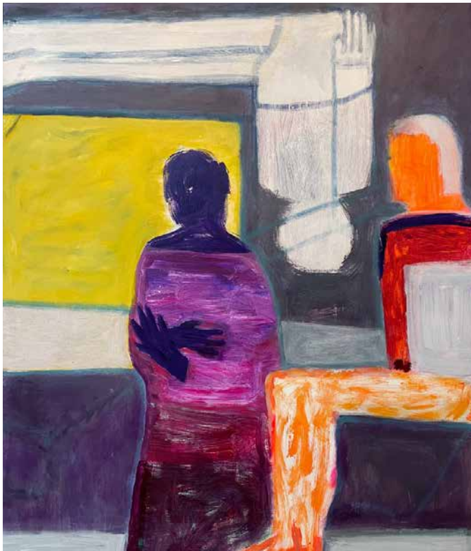
Katherine Bradford, Upsetting Times , 2020. Acrylic on canvas. 72 x 60 in. Courtesy of the artist and Canada, New York. Private collection. Photographed by Joe DeNardo.